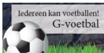
Today we ride for