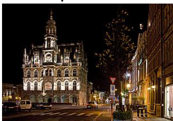
View city hall Oudenaarde